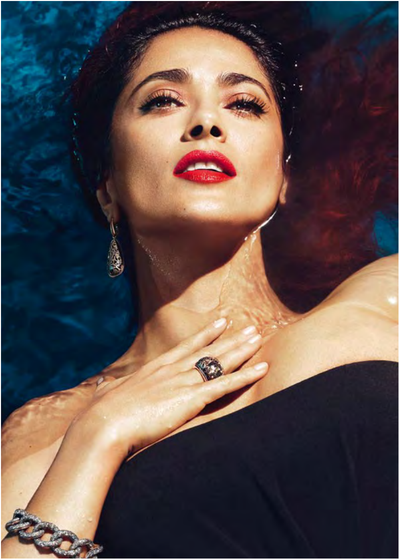
ARABESQUE NOIR COLLECTION SALMA HAYEK FOR POMELLATO - 2015