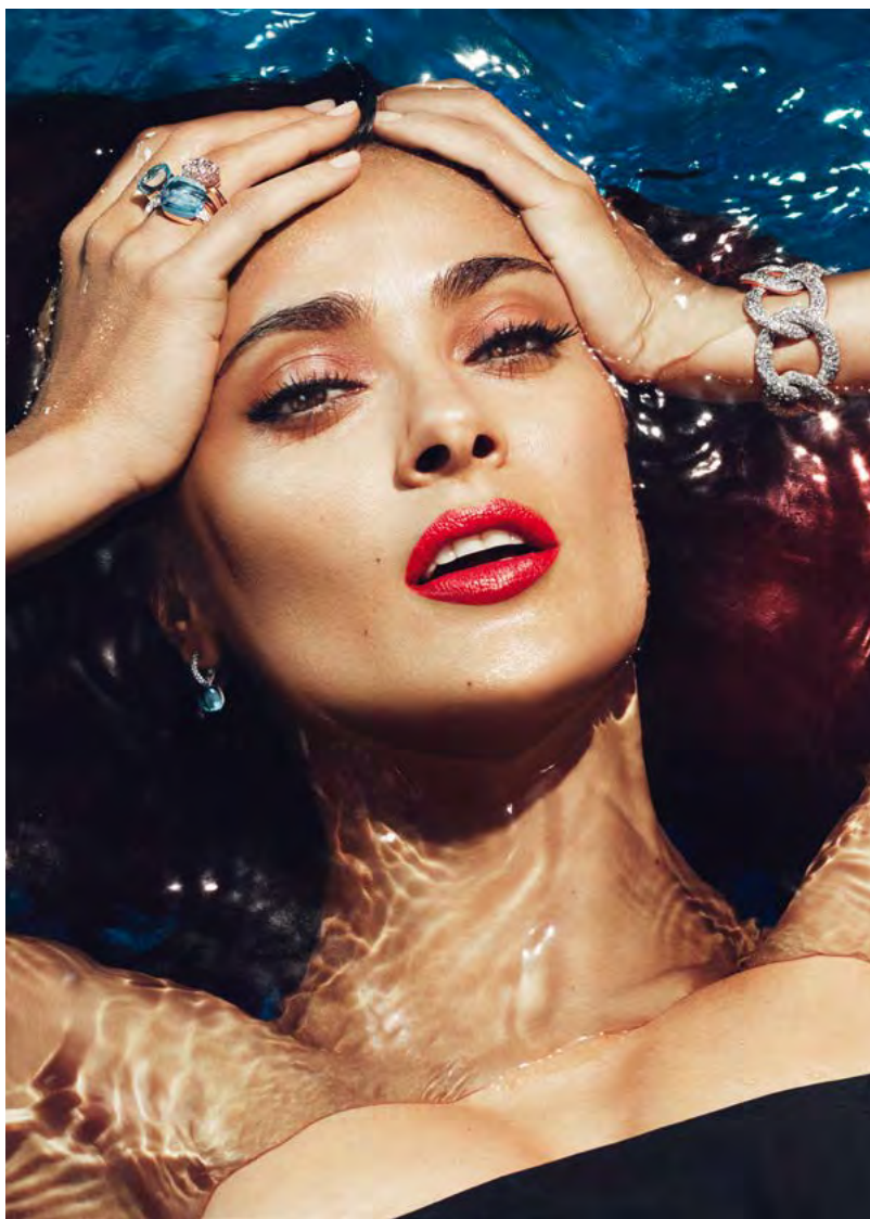
NUDO COLLECTION SALMA HAYEK FOR POMELLATO - 2015