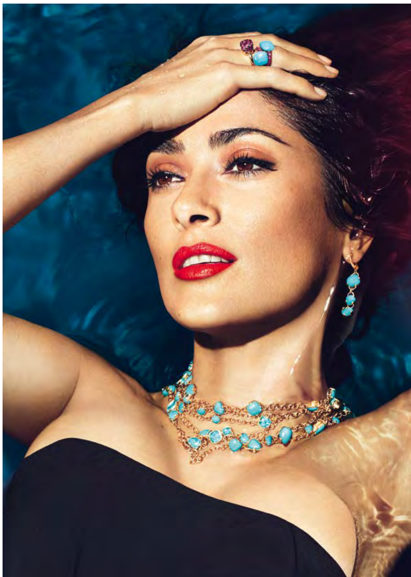
CAPRI COLLECTION SALMA HAYEK FOR POMELLATO - 2015