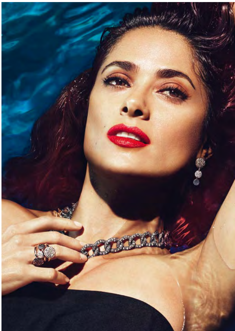
SABBIA COLLECTION SALMA HAYEK FOR POMELLATO - 2015