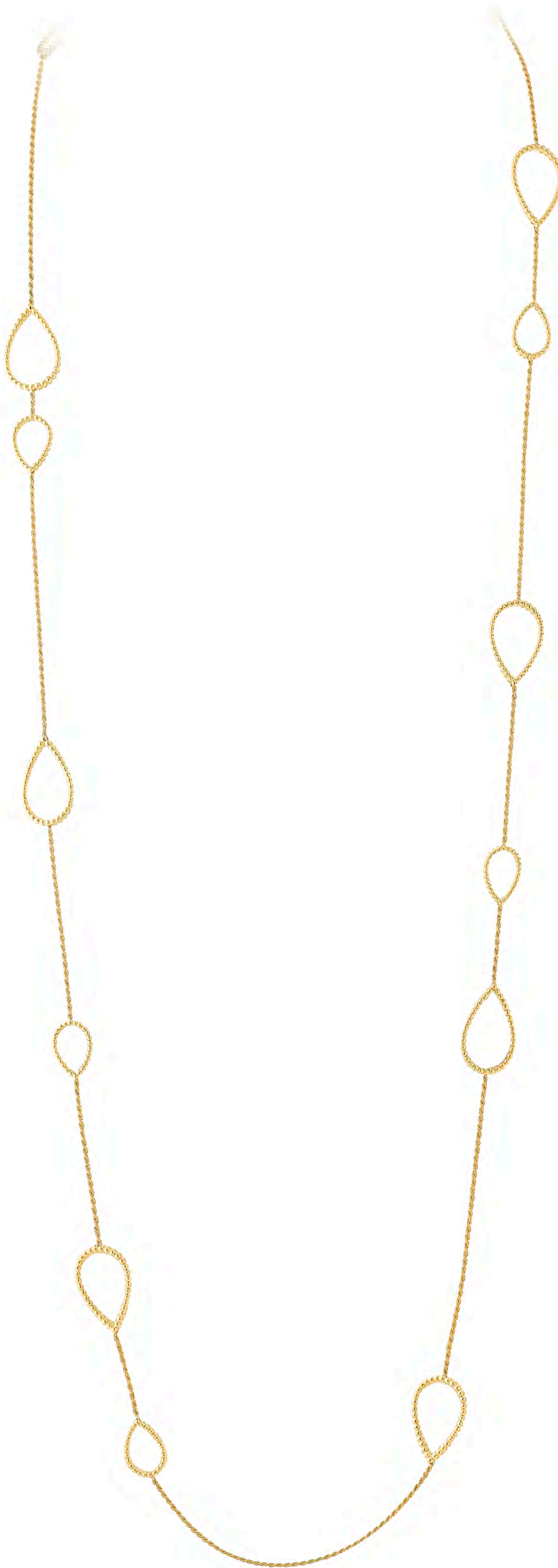
Serpent Bohème - Motifs Ajoures Long Necklace, in Yellow Gold