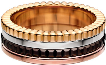
Quatre Classique - Small Model - Gold Ring