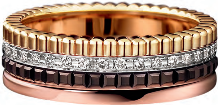
Quatre Classique - Small Model - Gold and Diamond Ring