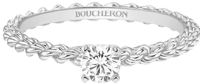
Serpent Bohème - Solitaire set in White Gold