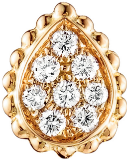
Serpent Bohème Studs - Small Model - Yellow Gold with Diamonds