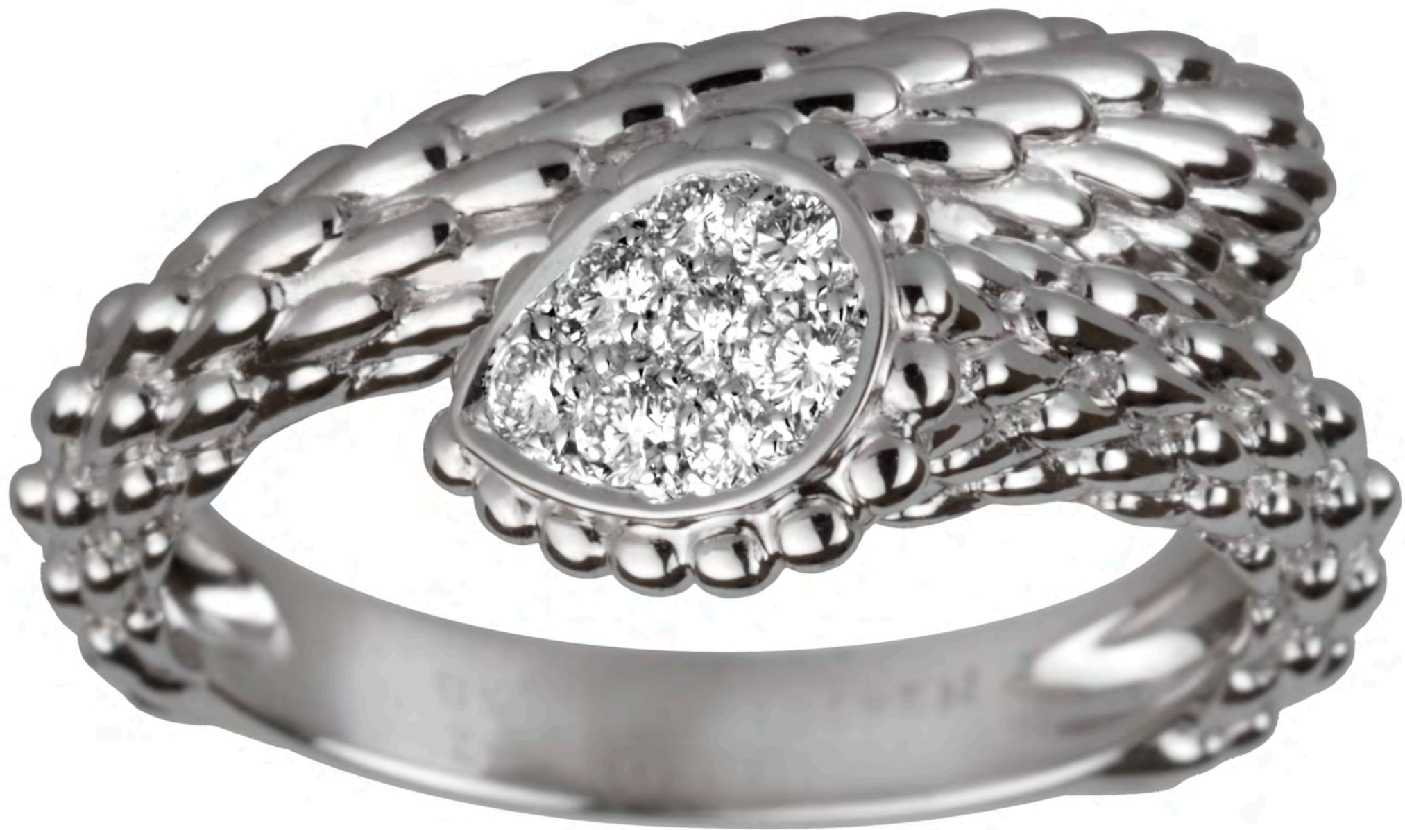
Serpent Bohème - Medium White Gold and Diamond Ring