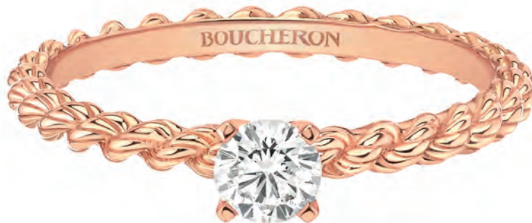
Serpent Bohème - Solitaire set in Pink Gold