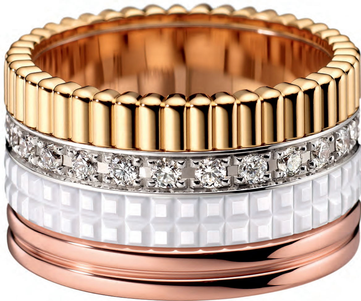
Quatre White Edition - Large Model - Gold and Diamond Ring