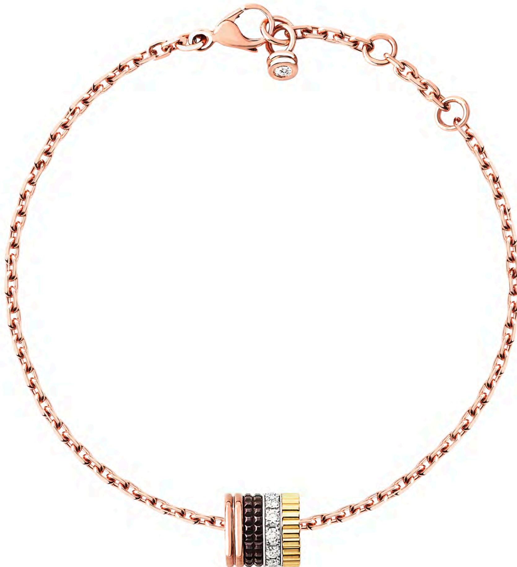
Quatre Classique - Gold and Diamond Bracelet