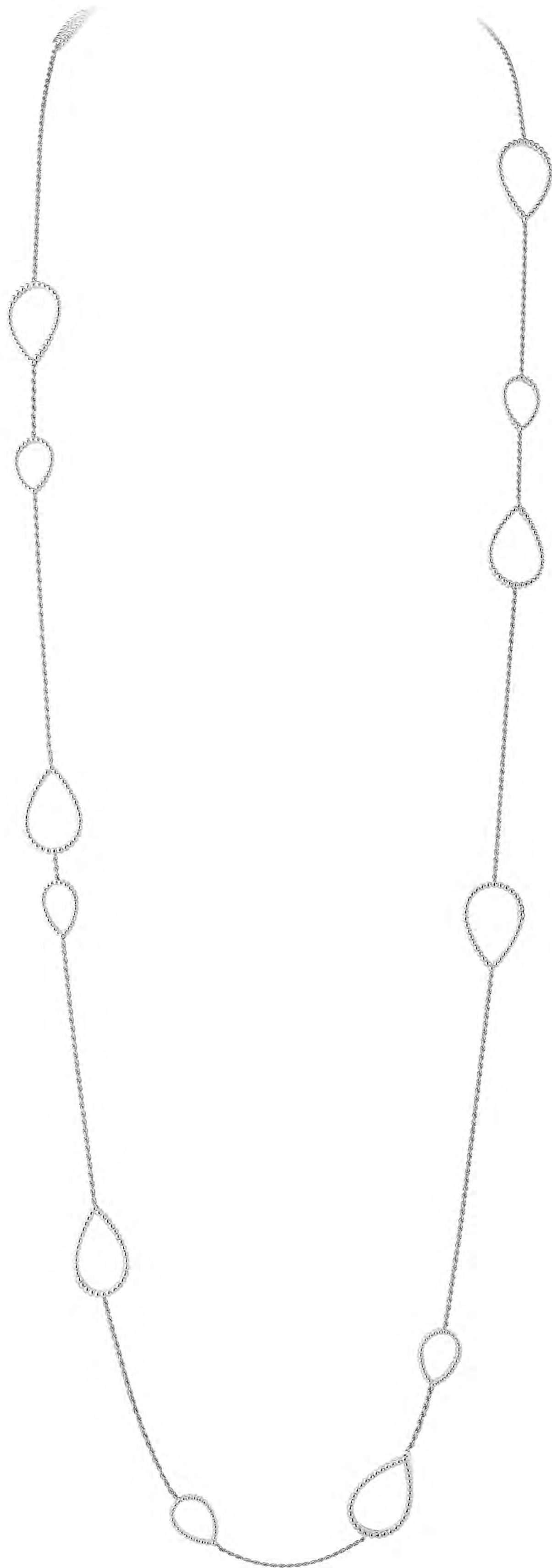
Serpent Bohème - Motifs Ajoures Long Necklace, in White Gold