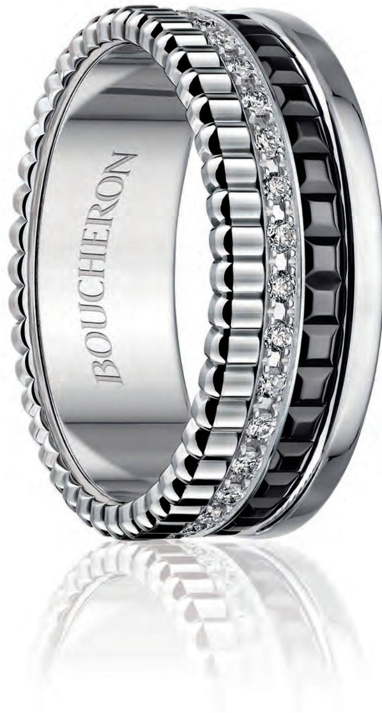
Quatre Black Edition - Small Model - Gold and Diamond Ring