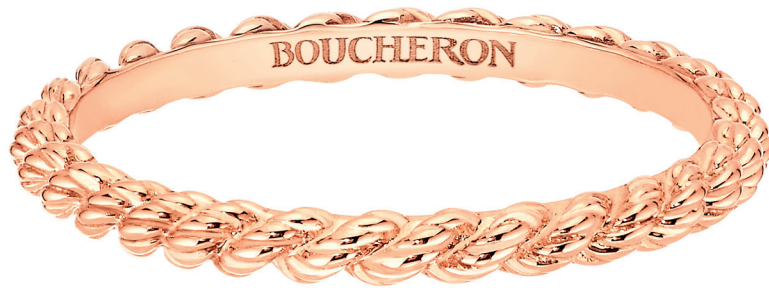
Serpent Bohème - Wedding Ring Set in Pink Gold