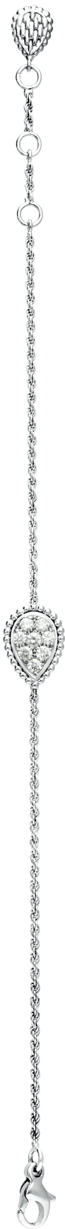
Serpent Bohème Bracelet