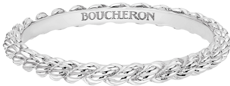
Serpent Bohème - Wedding Ring Set in White Gold