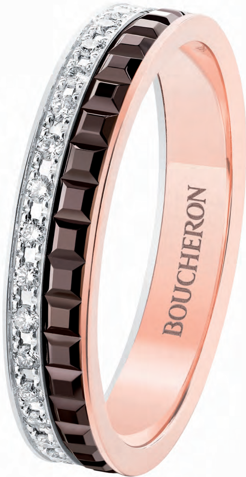
Quatre Classique - Gold and Diamond Wedding Band