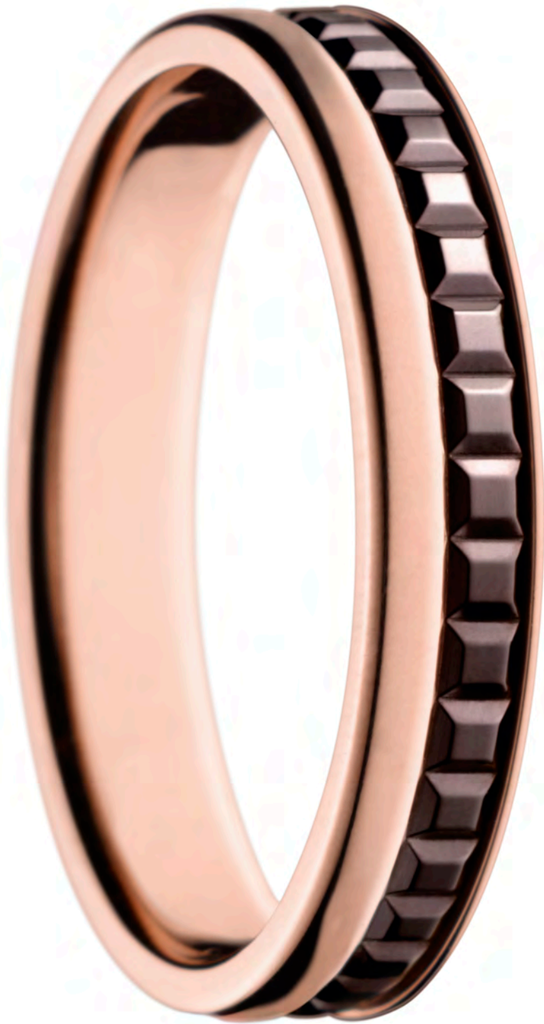
Quatre Classique - Gold Wedding Band