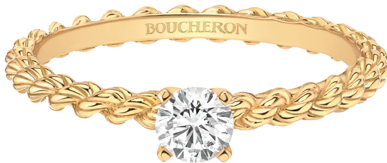
Serpent Bohème - Solitaire set in Yellow Gold