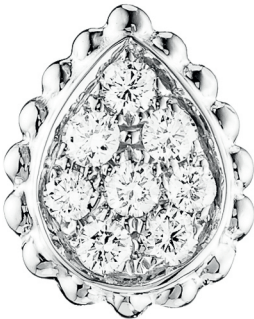
Serpent Bohème Studs - Small White Gold