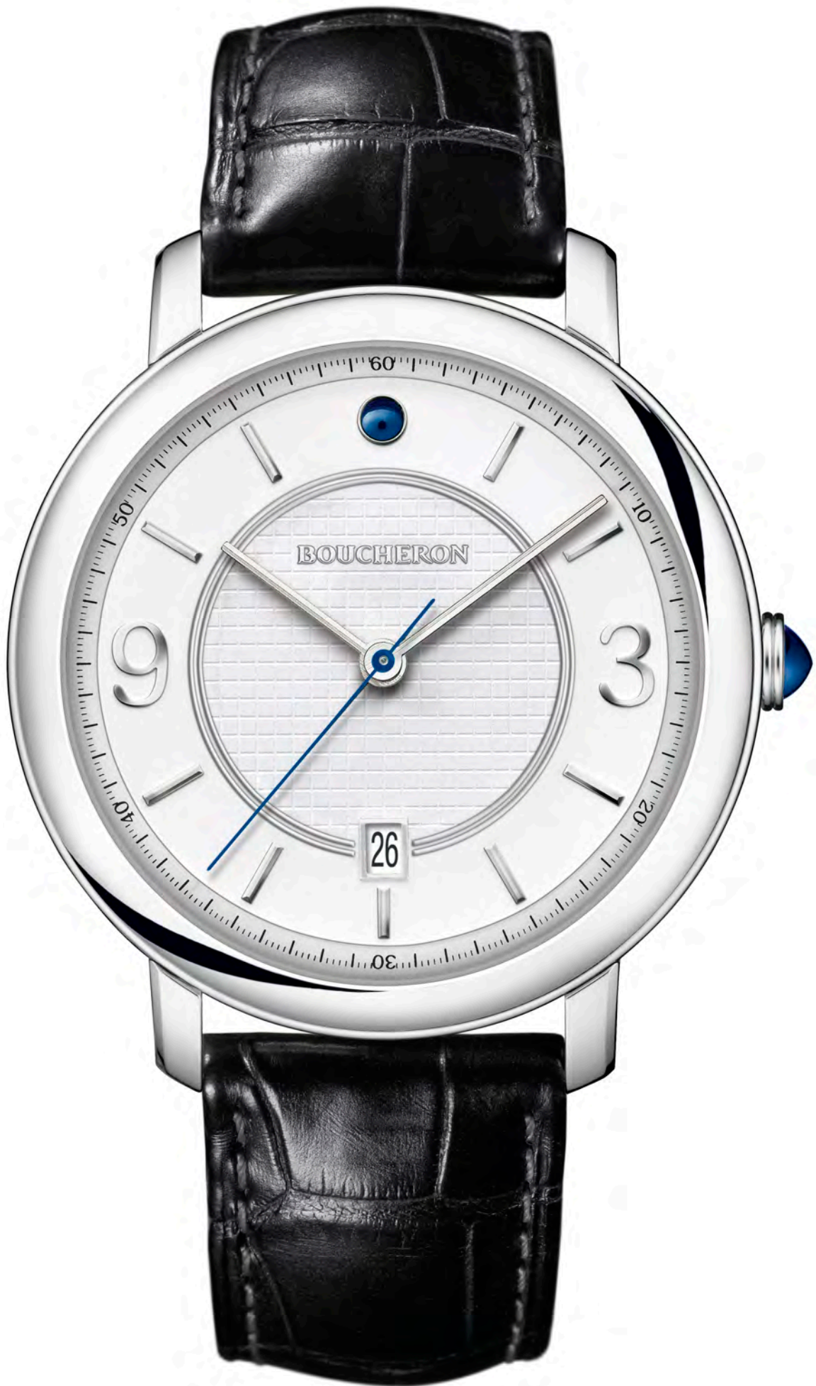
Epure Watch 38 mm - Steel, White Dial with Date Function - Automatic movement WA021201