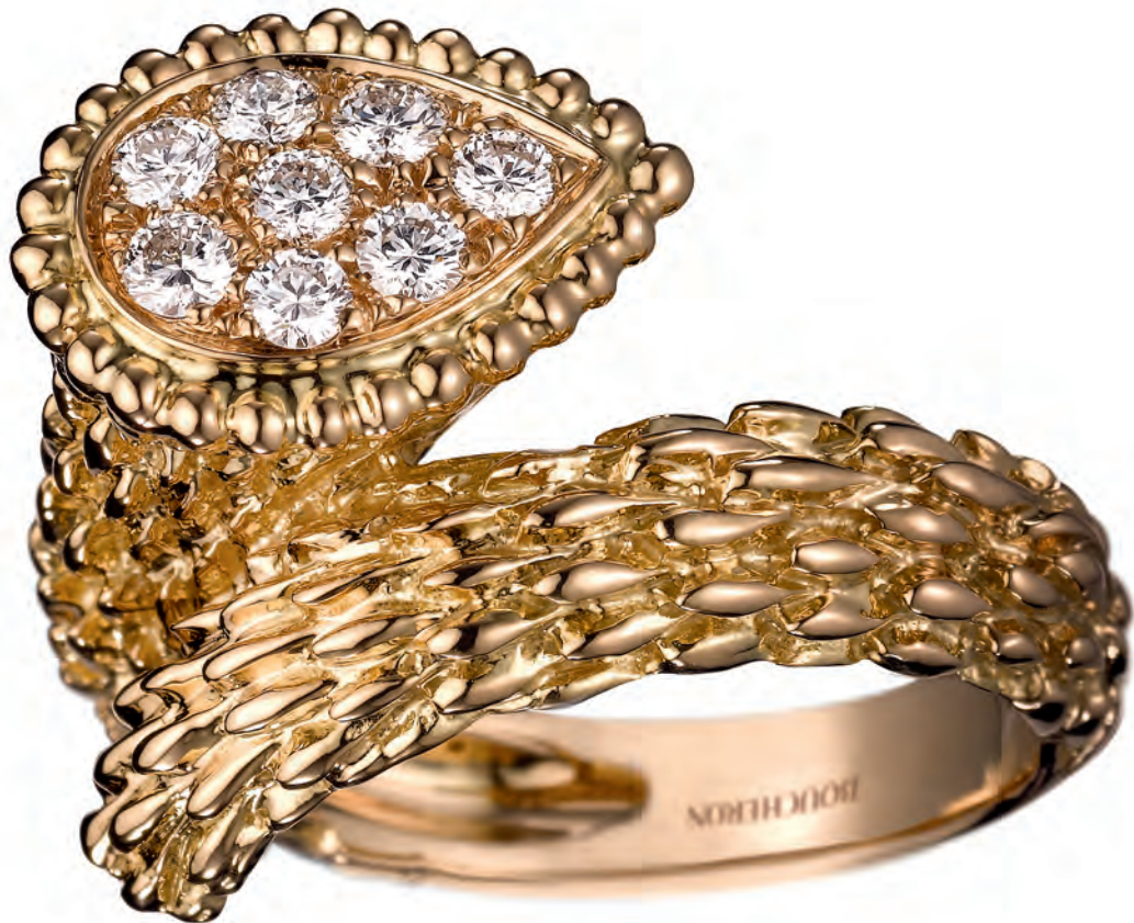
Serpent Bohème Medium - Yellow Gold and Diamond Ring